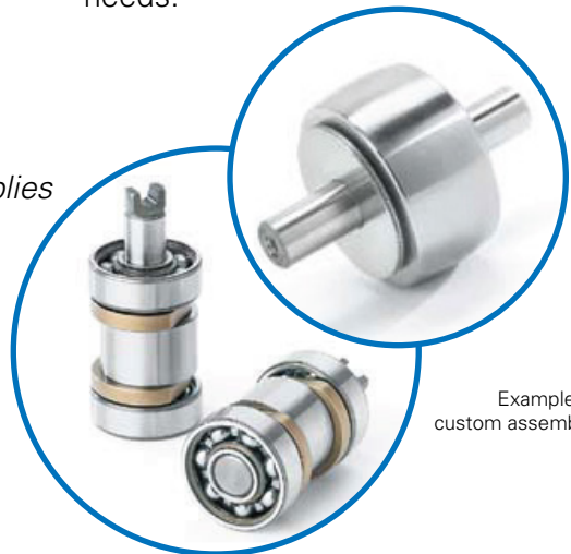
Examples of custom assemblies

We offer flexibility in product volumes from small to large batches and can design special custom packaging and kits based on your needs.